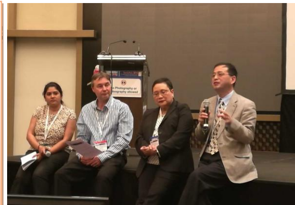
FOP WORKSHOP Q&A SESSION